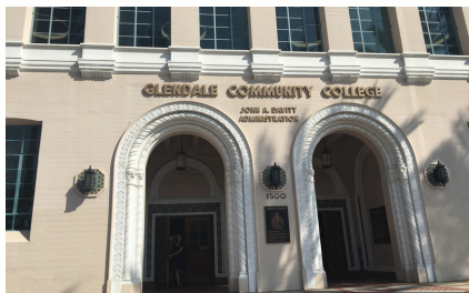
Reut Cohen Schorr

In 1934, a bond measure to purchase land and build permanent facilities failed. But undaunted, our students stepped up. They organized, campaigned, and won overwhelming community support the following year.