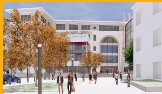
New Science Building