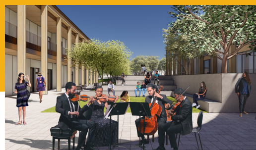
Performing & Media Arts Building