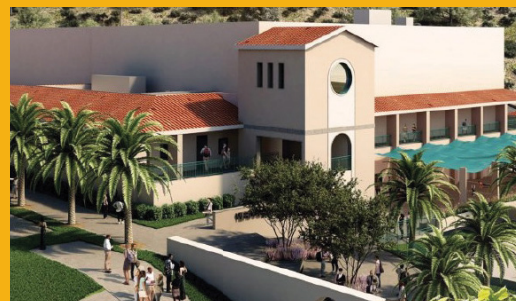
Kinesiology and Vaquero Athletic Complex

Glendale College Foundation (GCC) is rooted in this connected community and committed to overcoming any gap, no matter how wide. With valued input from the Foundation board, the GCC Board of Trustees, faculty, staff, alumni, donors, and other constituents, have created a strategic program with facility funding plans.