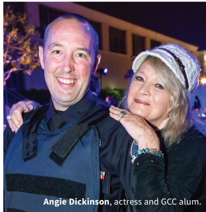
Angie Dickinson, actress and GCC alum.