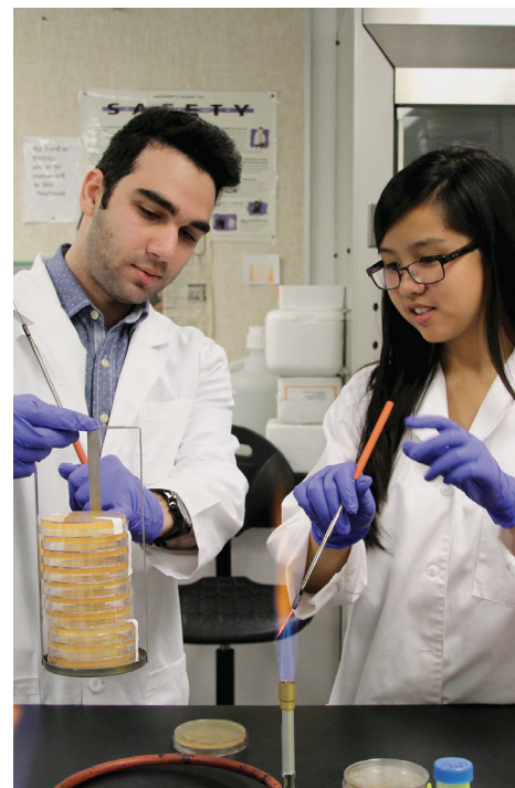
Students Involved in Research